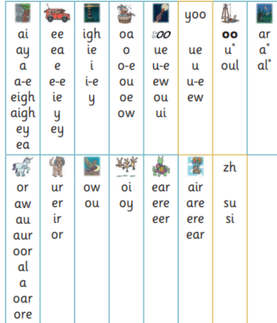
Grow the code grapheme mat Phase 2, 3 and 5